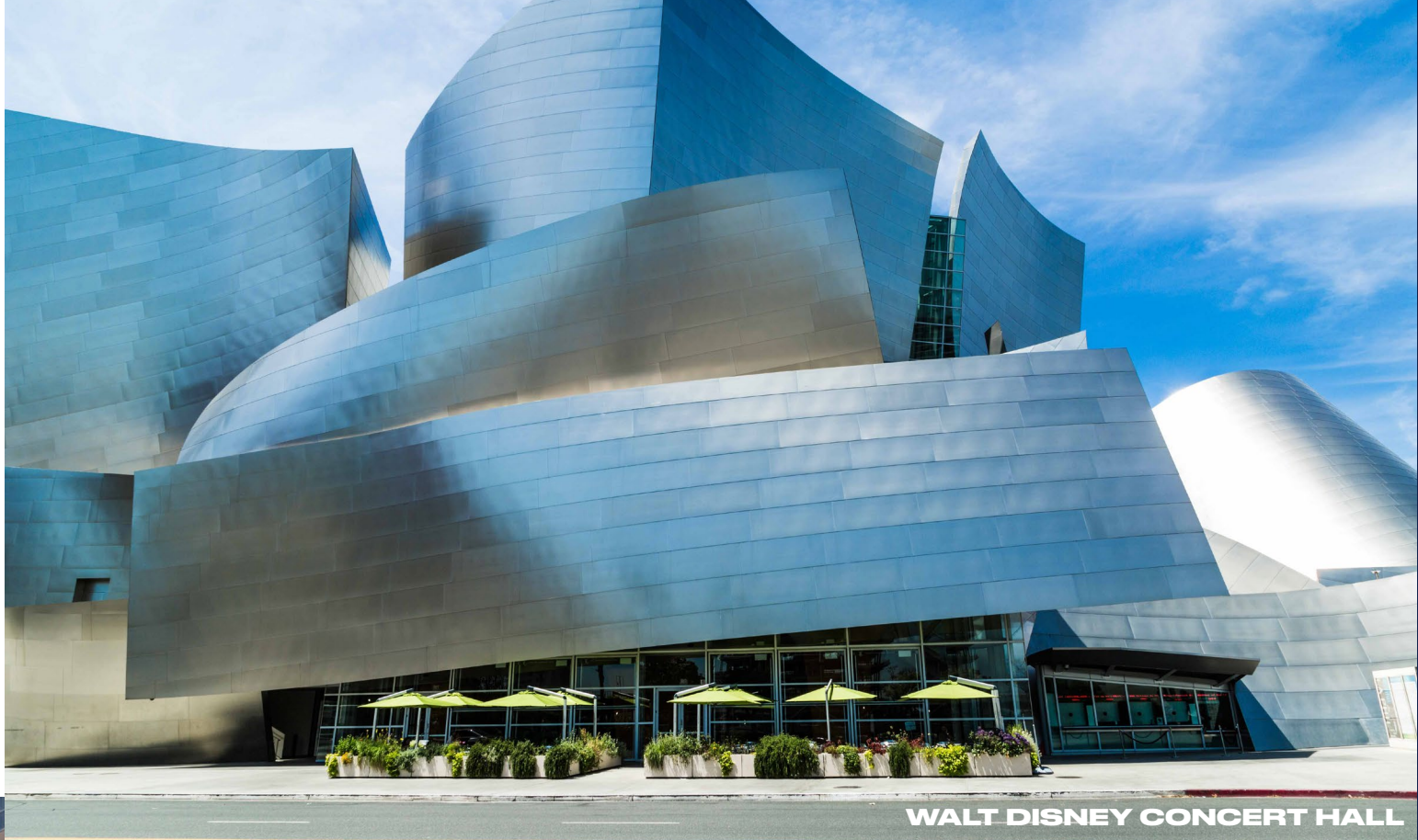
WALT DISNEY CONCERT HALL