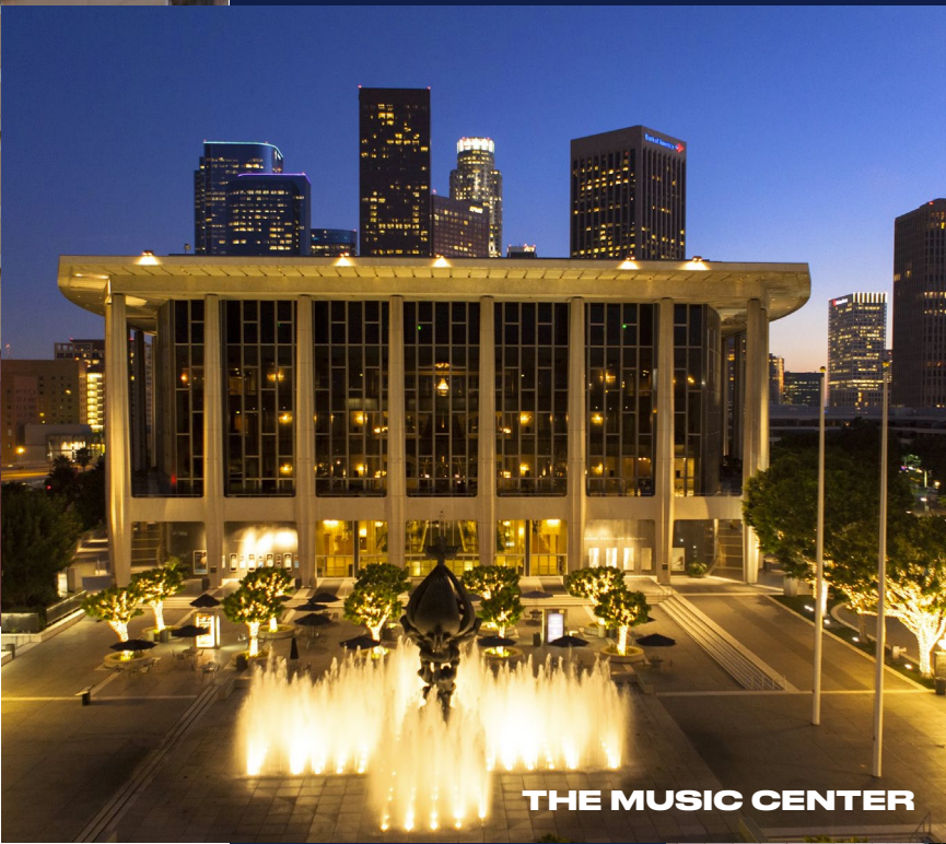
THE MUSIC CENTER