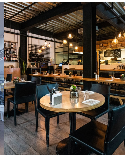
NICK + STEF'S STEAKHOUSE