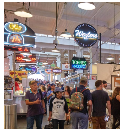
GRAND CENTRAL MARKET